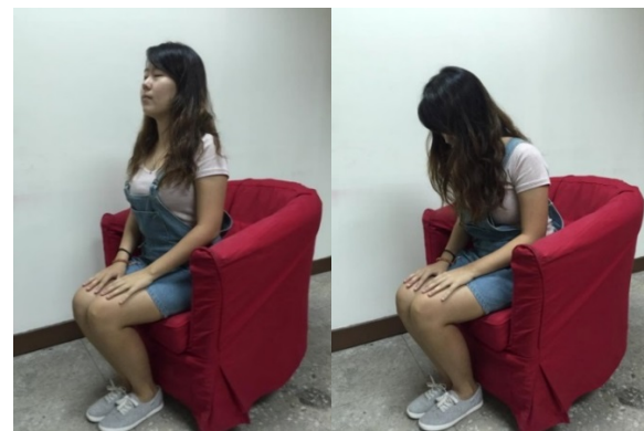
Figure 1. The erect and slouch postures.

Participants were asked to fill out demographic and psychological questionnaires and then sat in a comfortable posture on a sofa. The research procedure consisted of a 2 (erect and slouch postures; Figure 1) \times 2 (recalling happy or depressive events) Latin Square design.